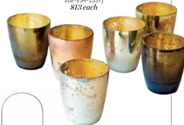
Subtle Shimmer Mercury-glass tea lights, at And Beige [1781 Florida Ave., NW; 202-234-1557] $13 each

"What could be a heavy piece takes on a new luster with multiple planes of gold. Don't limit this piece to a dining-room table—hang it in a hallway or foyer and it will add interest and effect."