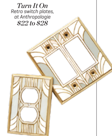
Turn It On Retro switch plates, at Anthropologie $22 to $28

"If you don't want to risk it on big walls, try it inside a closet turned bar, or on the ceiling of a powder room or in the backs of bookcases."