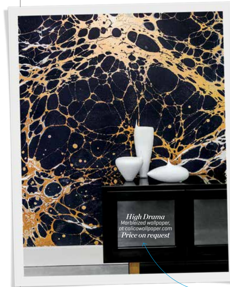
High Drama Marbled wallpaper, at calicowallpaper.com Price on request