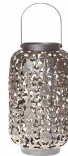
Light the Way Metal lantern, at zarahome.com $59.90