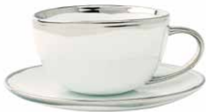
Gone Platinum Cup and saucer with metallic rim, at canvashomestore.com $22

"A shimmering Champagne pillow will look like jewelry on a chair or sofa."