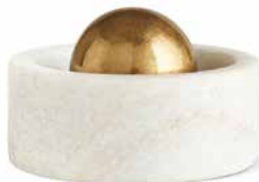
Gold Standard Stone spice grinder by Tom Dixon, at Design Within Reach $125