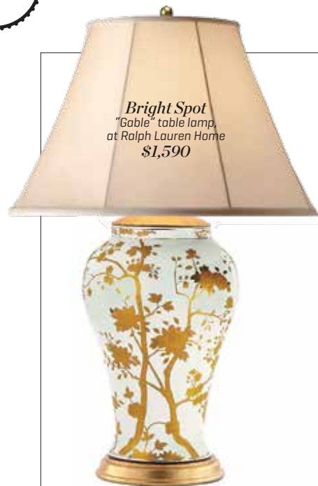
Bright Spot "Gable" table lamp, at Ralph Lauren Home $1,590