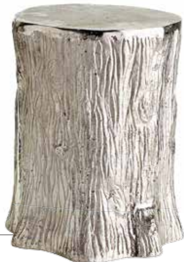
Into the Woods Silver faux bois stool, at wisteria.com $229