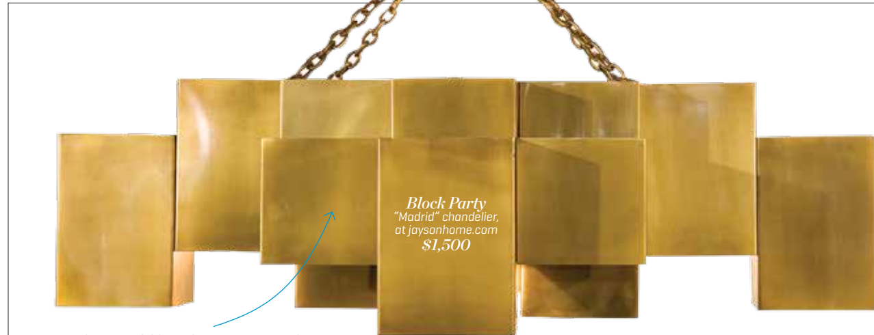
Block Party "Madrid" chandelier, at jaysonhome.com $1,500

"What could be a heavy piece takes on a new luster with multiple planes of gold. Don't limit this piece to a dining-room table—hang it in a hallway or foyer and it will add interest and effect."