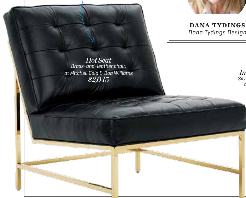
Hot Seat Brass-and-leather chair, at Mitchell Gold & Bob Williams $2,045

"The smallest use of brass on the frame gives a whole new look to this classic design."