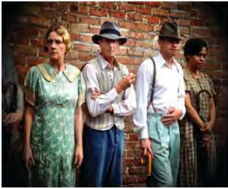
AT YOUR SERVICE The Butler provided creative fodder for Sheila Johnson, photographer, as she snapped some extras awaiting their on-camera entrance. Johnson helped produce the film starring Forest Whitaker.