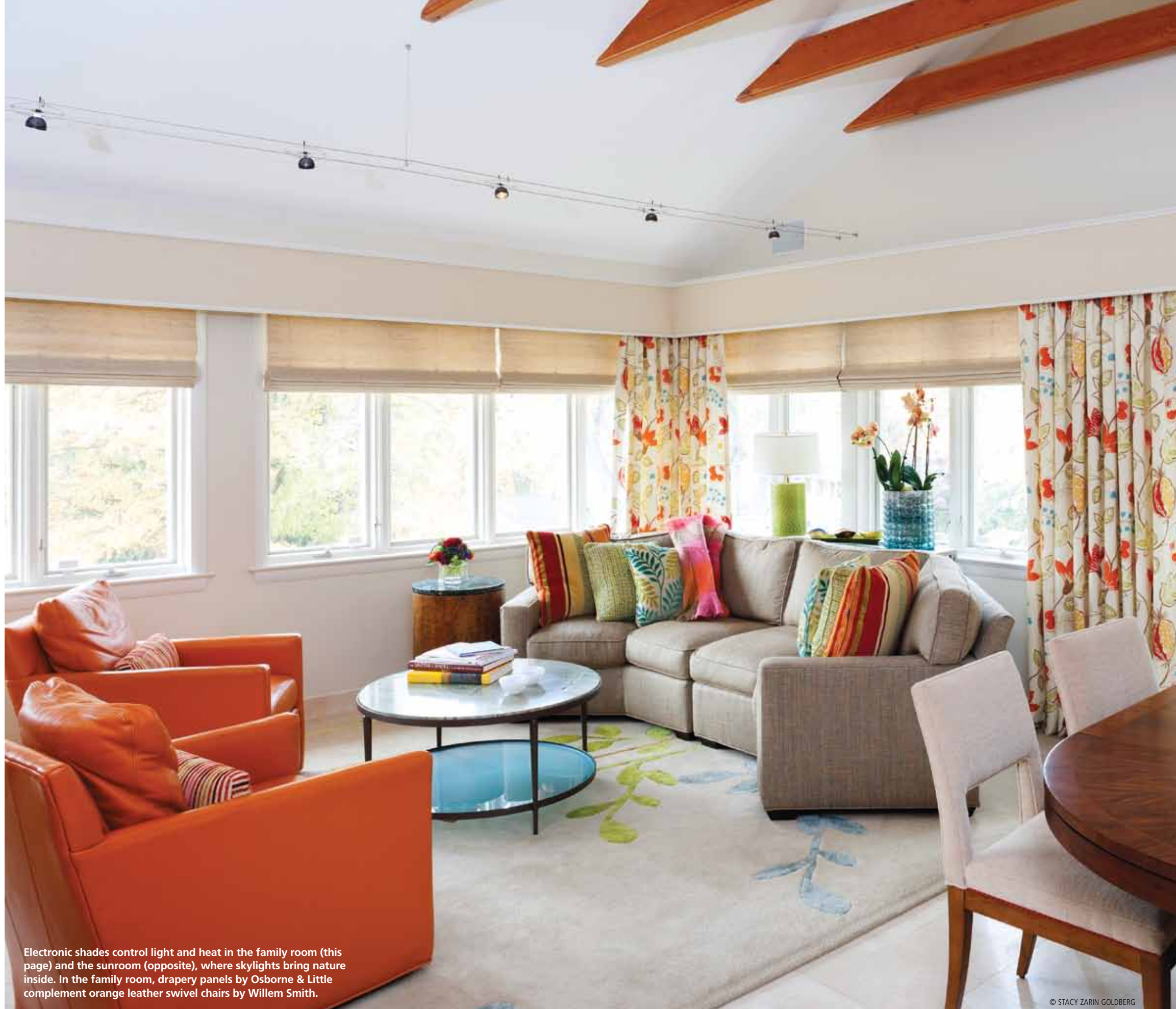
Electronic shades control light and heat in the family room (this page) and the sunroom (opposite), where skylights bring nature inside. In the family room, drapery panels by Osborne & Little complement orange leather swivel chairs by Willem Smith.