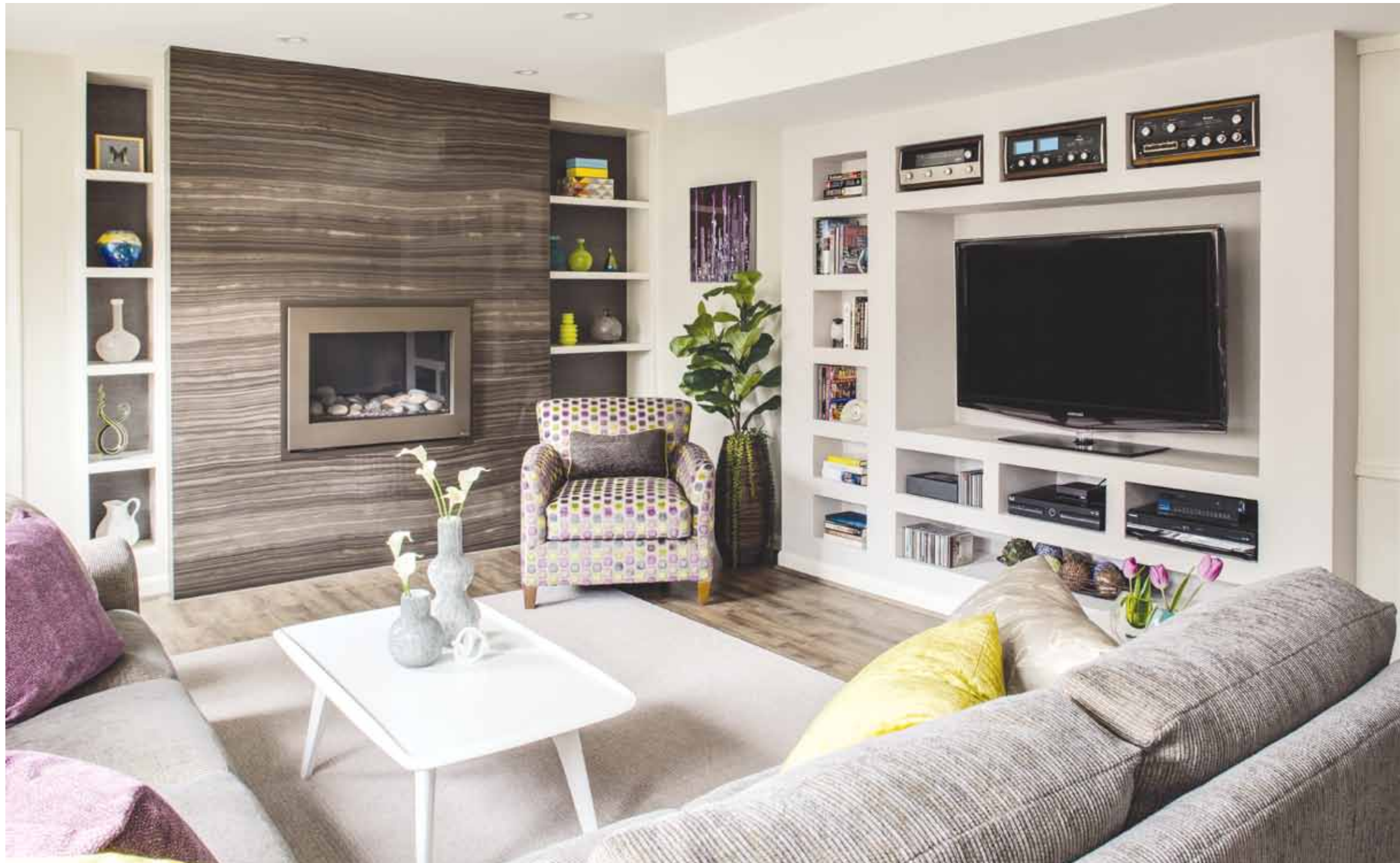
On the lower level, richly veined Eramosa marble surrounds the fireplace (left). Houck designed custom built-ins that house A/V equipment, along with Sandra Bullock's 1970s-era McIntosh stereo. Near the new aquarium (below), large floor pillows beckon the owners' young daughter while a pendant light by Nuevo hangs above the Tulip Table (bottom), where the family plays games.